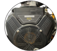
23 HP BRIGGS