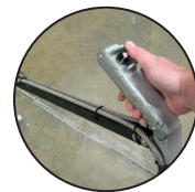
Ergonomic Handle with Start/Stop Switch