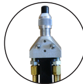
Re-buildable Dispensing Manifold