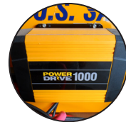
Optional Power Inverter