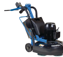
GRINDERS & POLISHERS