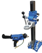
DRILLS & STANDS