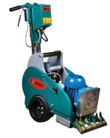
WALKBEHIND FLOOR SCRAPERS