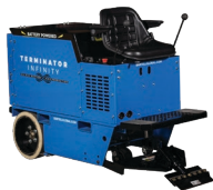
RIDE-ON FLOOR SCRAPERS