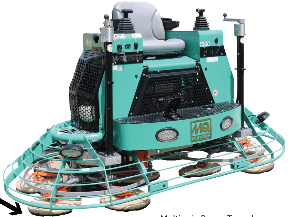
Multiquip Power Trowel