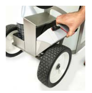
EASY TO ACCESS BATTERY