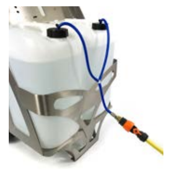
QUICK FILL HOSE ADAPTOR