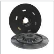
Premium Double Hook Pad Driver w/ Riser #A0017 - 13" #A0034 - 15" #A0010 - 17" #A0011 - 20"