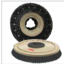
Stiff Poly Scrub Brush For General Scrubbing #A0020 - 13" #A0036 - 15" #A0002 - 17" #A0003 - 20"