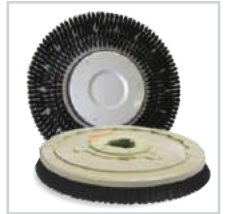
Hawk Spin Safe Carpet Brush w/Adjustable S/S Glide Plate Bears Machine Weight, Protects the Carpet #A0013-17 - 17" #A0013-20 - 20"