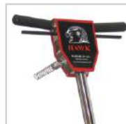
Welded Steel Frame, Handle & Brush Covers