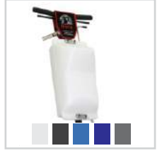
4.5 Gallon Solution Tank 5 Stock Colors 4 Special Order Colors #A0001-4-Color