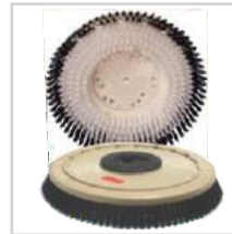
Nylon Carpet Brush Scrub with Soft & Stiff Nylon Bristle Mix #A0016 - 13" #A0037 - 15" #A0006 - 17" #A0007 - 20"