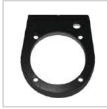
20# Frame Weight #HPA0032-2P