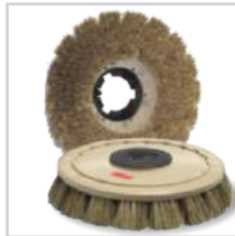
Tampico Polishing / Scrubbing Brush #A0021 - 13" #A0035 - 15" #A0004 - 17" #A0005 - 20"