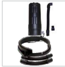
Vacuum Assembly Kit Dust Ring, Tank Vacuum & Hardware #TH1011-STD17 - 17" #TH1011-STD20 - 20"