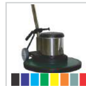
Brush Covers in 7 Stock Colors Plus Chrome