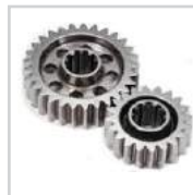
XHD 11:1 Gears