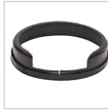
Splash Guard #SPLASH13 - 13" #SPLASH15 - 15" #SPLASH17 - 17" #SPLASH20 - 20"