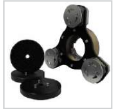
Tri-Headed Orbitec Diamond Driver 6" and 8" Pads & Brushes, Steel Clutch Plate For XHD #HP0015 - 16X6" #HP0015-8 - 16X8"