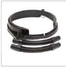
Dust Pickup Systems for 66 Frame Motors #HP0031-DC17-STANDKIT #HP0031-DC20-STANDKIT