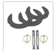
XHD Has Power & Gears for Add-on Weights