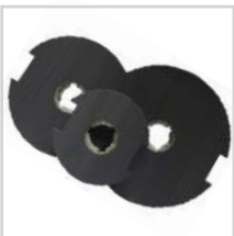
Weighted Diamond Pad Driver For XHD Steel Block & Clutch Plate #A0017WTDPD - 12" (25#) #A0010WTDPD - 17" (46#) #A0011WTDPD - 20" (64#)