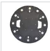
HAWK Claw Diamond Disc Driver For XHD #CLAW13 - 13" #CLAW15 - 15" #CLAW17 - 17"