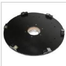
HAWK Surface Prep Scraper with Replaceable Cutting Blades for XHD #HP0033 - 17" #HP0034 - 20"