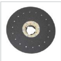
Diamond Pad Driver For HD & XHD #A0017DPD - 13" #A0034 - 15" #A0010DPD - 17" #A0011DPD - 20"