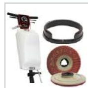
DX Package Includes Pad Driver, Solution Tank & Splash Guard