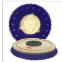
Lite Grit Brush Scrub with Flexible Blue 150 Grit Bristles #A0018-1 - 13" #A0038-1 - 15" #A0008-1 - 17" #A0009-1 - 20"