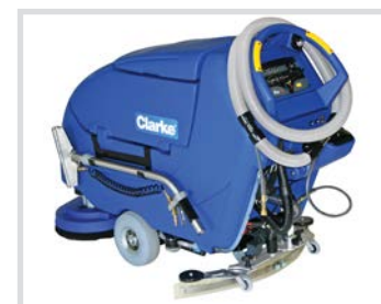
Optional off-aisle wand kit with telescoping wand for compact storage.