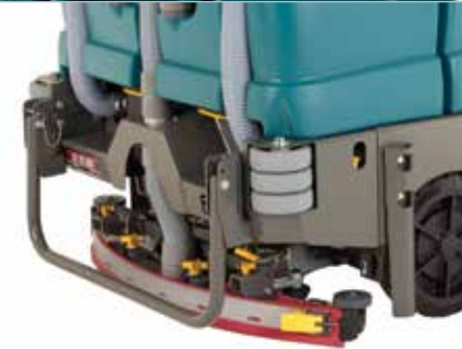
Dura-Track™ Parabolic Squeegee