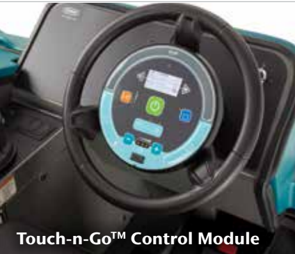
Touch-n-Go™ Control Module