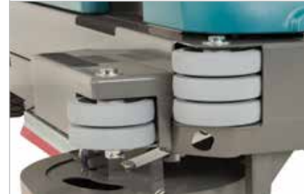
Heavy-duty Frame and Cushioned Corner Rollers

Overhead guard protects operators from falling objects.