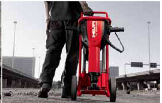
The TE 3000-AVR needs no compressor and is therefore easy to transport, highly versatile and ready for use in minutes.