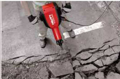
Breaking up asphalt the quick, easy way – for road building, repair work and pipe laying.