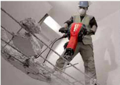
The mighty TE 3000-AVR brings impressive hammering power to big concrete demolition jobs.