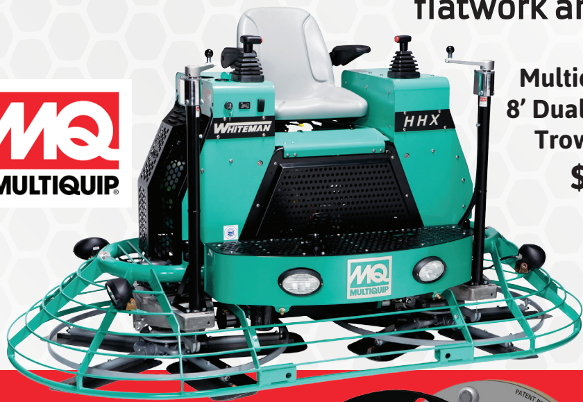
Multiquip HHXDF5 8' Dual Fuel Ride-On Trowel Machine $28,500