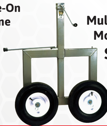
Multiquip Easy Mover Dolly $1,300