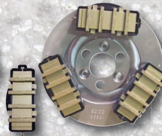
Dyma-SERTS 5 times faster than grinding stones. Long Lasting!