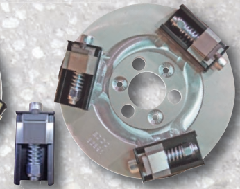
STRIP-SERTS Removes surface build-ups without grinding into the surface below

Magnetic Quick-Change Multi-Accessory Disc is quick change technology - Change accessories in less than 30 seconds, accessories slide on and off, no tools required!