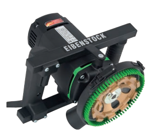
5" dia. Heavy-Duty EBS 1802.1