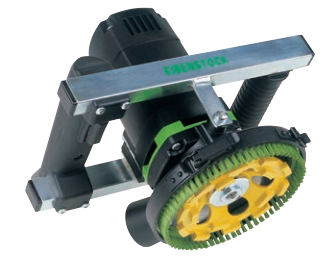
5" dia. EBS 125.5 D