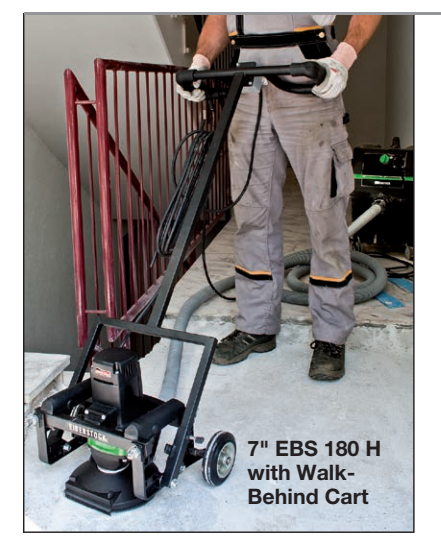
Optional Walk-behind Carts: for EBS 125.5 D - P/N 37210 for EBS 180 H - P/N 37217

See page 21 for dust extraction systems.