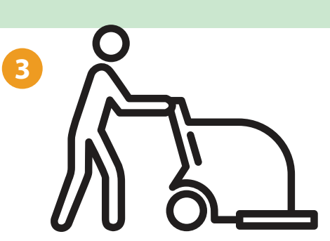
That's it. You are now ready to clean.